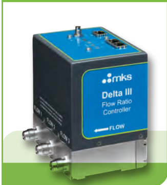
ETG: MKS Specific